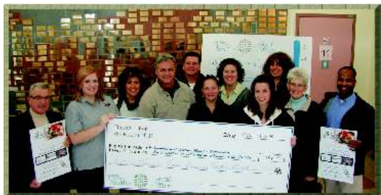
Pictured are sponsors and representatives from all participating restaurants. Thank you!

sponsor for this event. As a media sponsor, 99.3 EZ Rock and Q92 promoted “Dining... for the Health of it!” with a combination of on-air promotional commercials, live announcer mentions, and web exposure on both www.ezrocktimmins.com and www.q92timmins.com .