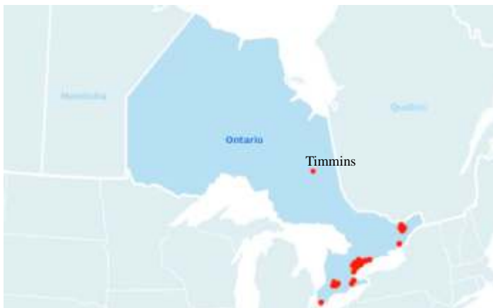
This map represents the cities in Ontario who offer a Retina Subspecialty.