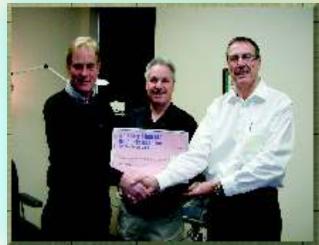
Simpson and Beaulne Optometrists - $ 2,000