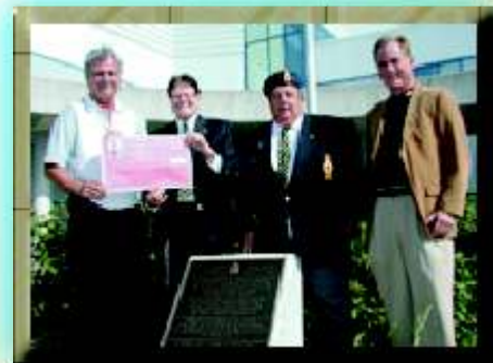
Royal Canadian Legion Branch 88 - $5,000