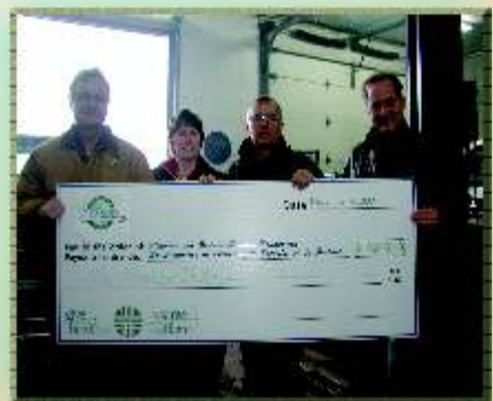
The Ontario Automotive Recyclers Association (OARA) - $ 10,000