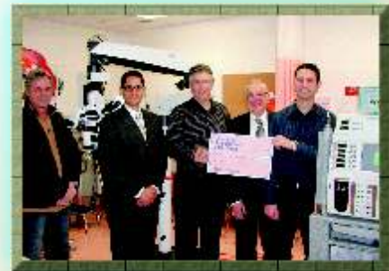
Porcupine Optometrists Association - $ 5,000 Proceeds will go towards Ophthalmology services